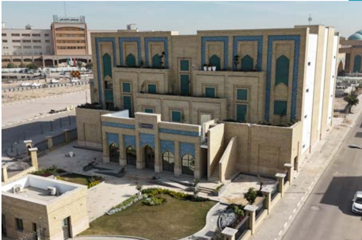
Luminous Stars Centre Al-Markaz, Najaf

Your support has been vital in making this possible, creating lasting change for generations to come.