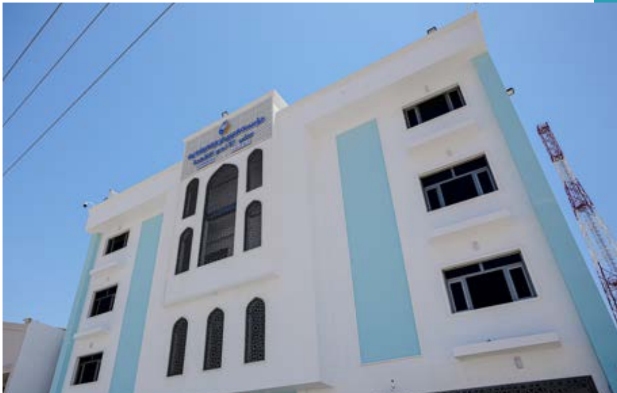
Luminous Stars Centre Al-Samawa, Muthanna